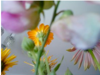
Foulon_01.jpg (861 KB)

For receiving high-resolution press images, please contact: Baptist Ohrtmann, bo@temporarygallery.org