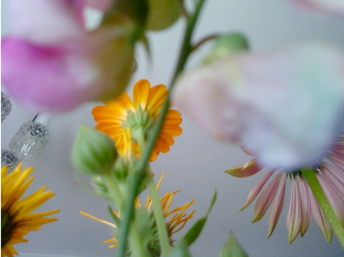
Olivier Foulon: Untitled [Flowers] , 2016/17