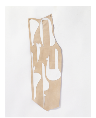
Jotta_06_Tabua_J30 03a.tif (17 MB)

Ana Jotta Tábua, 2001 sewn leather, eyelets 84 x 28 cm