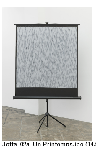
Jotta_02a_Un Printemps.jpg (14,9 MB)

Ana Jotta Un Printemps, 2008 Acryl and felt pen on projection screen 160 x 129 x 16 cm Courtesy: the artist and ProjecteSD, Barcelona Photo: Roberto Ruiz