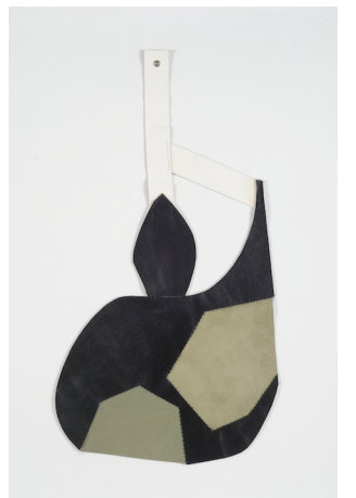
Jotta_03_Ninho_0881.tif (36,7 MB)

Ana Jotta Ninho, 2001 sewn leather, eyelets 50 x 27 cm