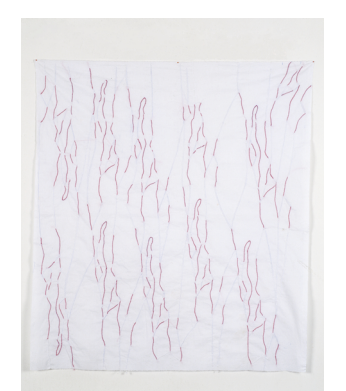
Jotta_07_UntiteId_J20 02a.tif (24 MB)

Ana Jotta Ohne Titel, 1994 linen, stiched with white and pink thread 101 x 98 cm Courtesy: the artist and Laura Castro Caldas, Lisbon Photo: Laura Castro Caldas