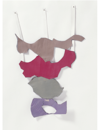
Jotta_05_Nuvem_J27 03a.tif (13,7 MB)

Fundación Serralves, Porto